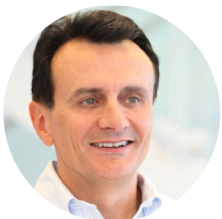
Pascal Soriot CEO AstraZeneca

It is critically important to us that the Third Parties we work with share our values and ensure that any work on our behalf upholds our ethical standards. Only together can we maintain and enhance the trust of our customers and stakeholders and, ultimately, deliver our purpose: to push the boundaries of science to deliver life-changing medicines.